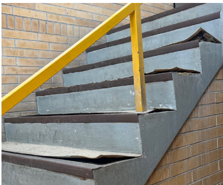
Damaged stair tiles